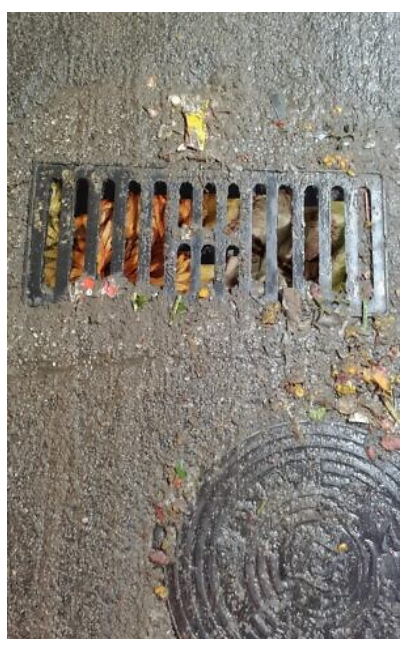
One of the photograph's from artist Eli Patel's solo exhibit at the Bat Yam Museum of Art, reopening June 6, 2020. (Courtesy Eli Patel)