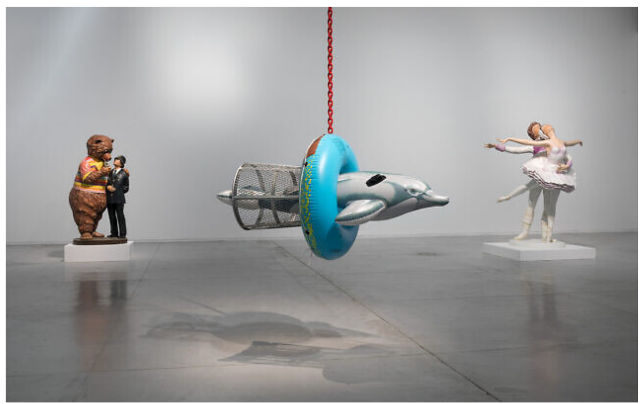
Jeff Koons' artworks set up in the Tel Aviv Museum of Art, now reopened on June 2, after the coronavirus closure.

Museums are opening their doors again in Israel, after months of closure.