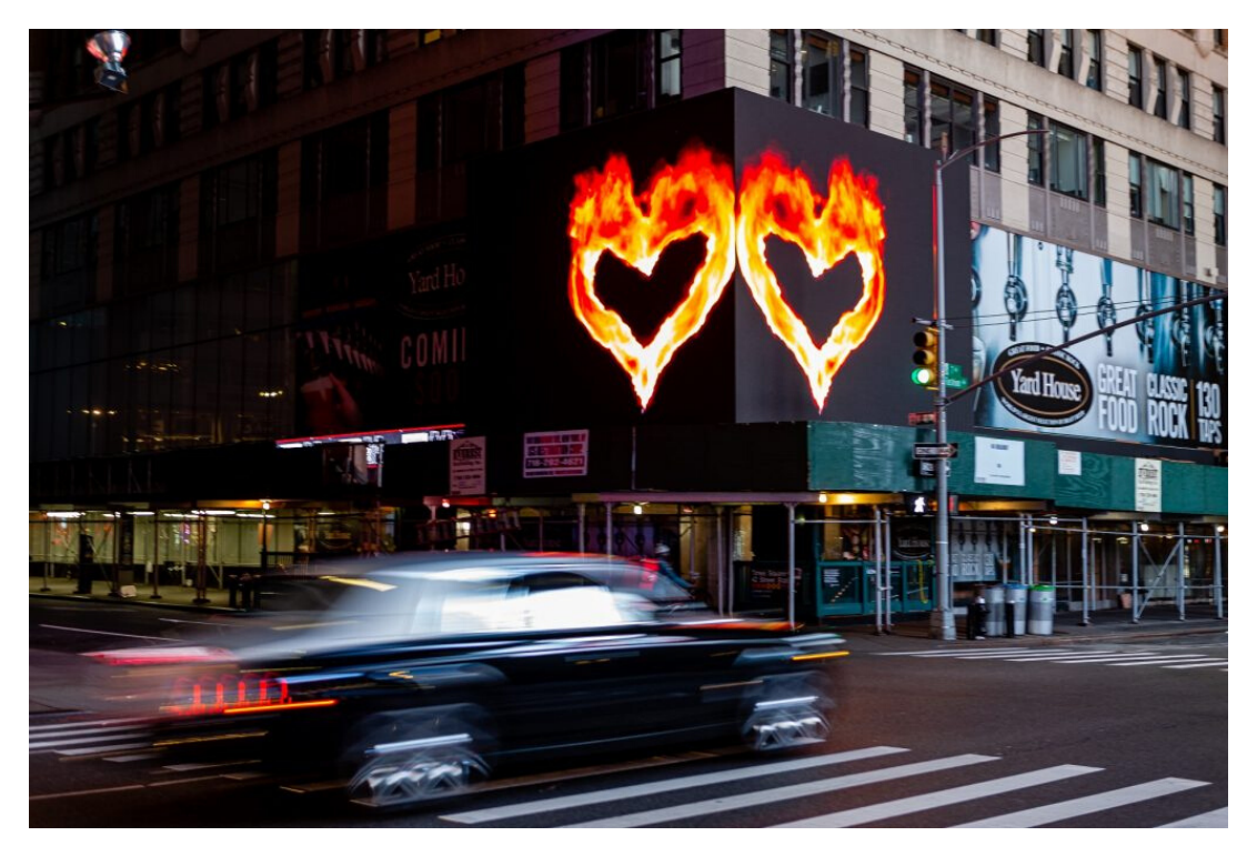
The Tel Aviv Museum of Art will exhibit Israeli art in New York City's Times Square.

The museum will offer a new voice guide app for visitors who want to practice social distancing and tickets will be sold online.