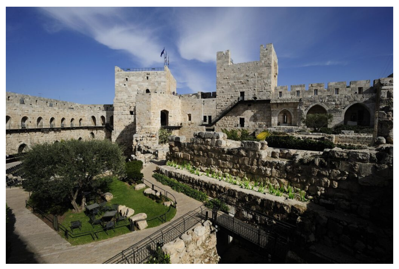
David's Citadel (King David's Tower) at the Tower of David Museum.

There is a new audio guide for the Kishle excavations that will allow people to delve into Jerusalem's history and discover the foundations to King Herod's palace.