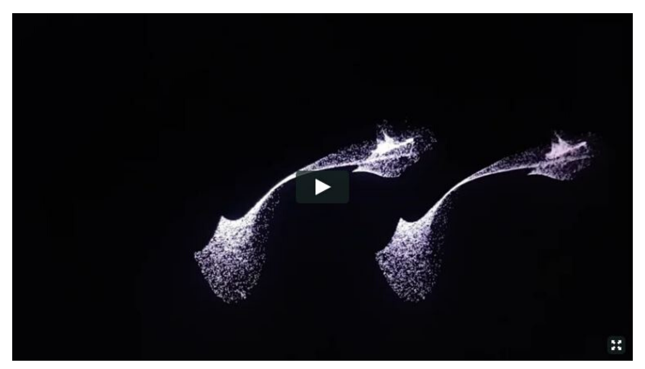
Body double, Video by Antoine Schmitt, Part of "Data Thread" exhibit at Galerie Charlot. Courtesy.

Tel Aviv-based artist Ron Aloni sculpts organic forms sometimes linked to the marine or astral universe and through weaving, creates forms that are both aerial and whose presence reflects a force. His sculptures, which are wall-mounted, suspended, or simply placed on the ground, have colors linked to metallic material and fluorescent. Parisian-based artist Antoine Schmidt creates installations that address the processes of movement in all of their modalities.