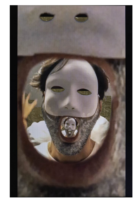
Mask by Eli Petel. Courtesy.

The exhibit is comprised of about 30 works that can be called photographs. Mostly taken in the street, in the market, or in the studio, the photographs capture mundane moments and