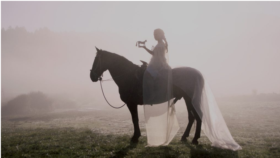
Still from the video installation The Meeting of the Horse , Eleni Giannopoulou and Tania Reza, 2020.

Reza and Giannopoulou choose to collaborate with an all-female and Mexican crew of artists and cinema professionals in an effort to honor and stand in solidarity with the powerful feminist movements that are currently fighting for women's rights in Mexico.