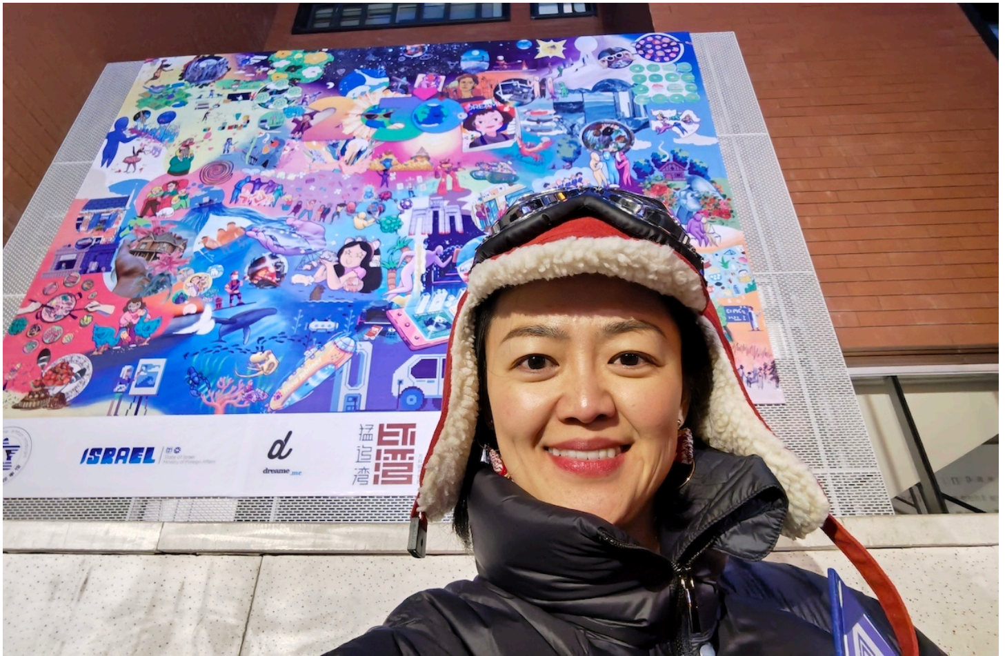
The Big Dream art project in Chengdu, China, 2020