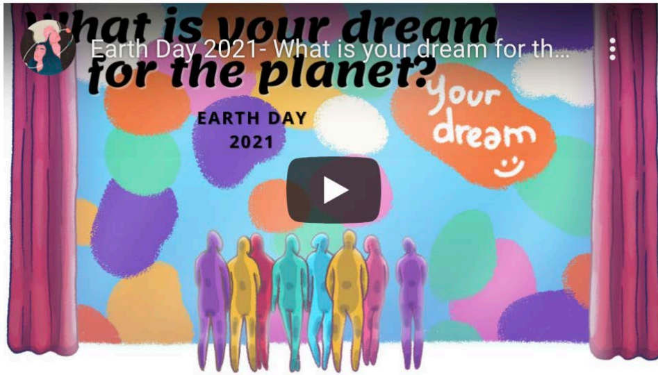
The Big Dream art project unveils around the world on International Peace Day.

The current project is an even larger undertaking with Dreame, the company behind The Big Dream, calling for more people from all over the world to contribute their individual personal dreams starting on Earth Day, April 22. Dreams can be uploaded onto the Dreame website before being amalgamated into one larger collaborative work of art.