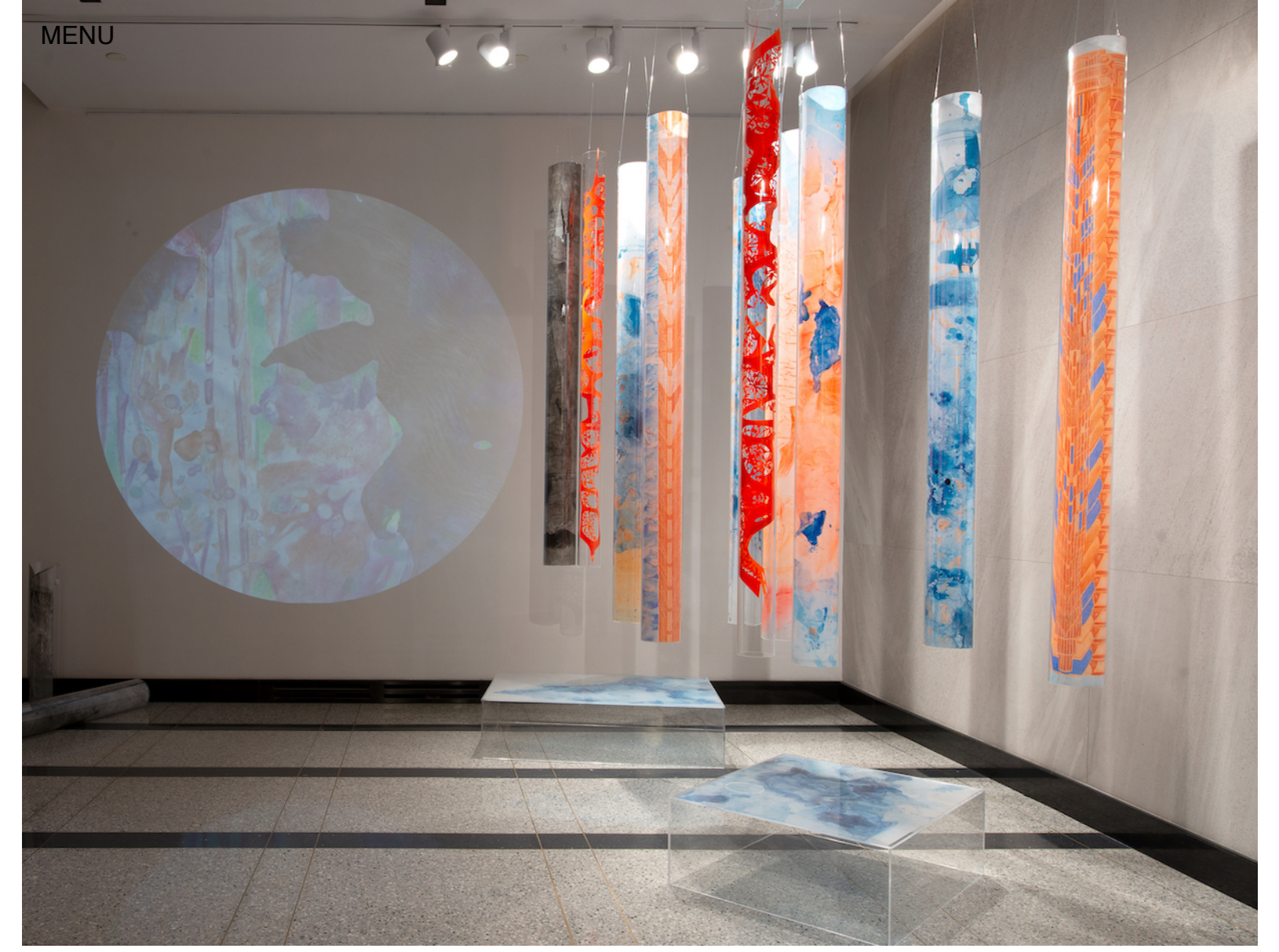
Keren Anavy, I Wish I Had a River, The Underground Lobby Garden, 2021 (detail), site-specific installation at ZAZ10TS Lobby Gallery Space. Video projection, ink and colored pencil on Mylar, Plexiglas.

Keren Anavy: I Wish I Had A River, The Underground Lobby Garden