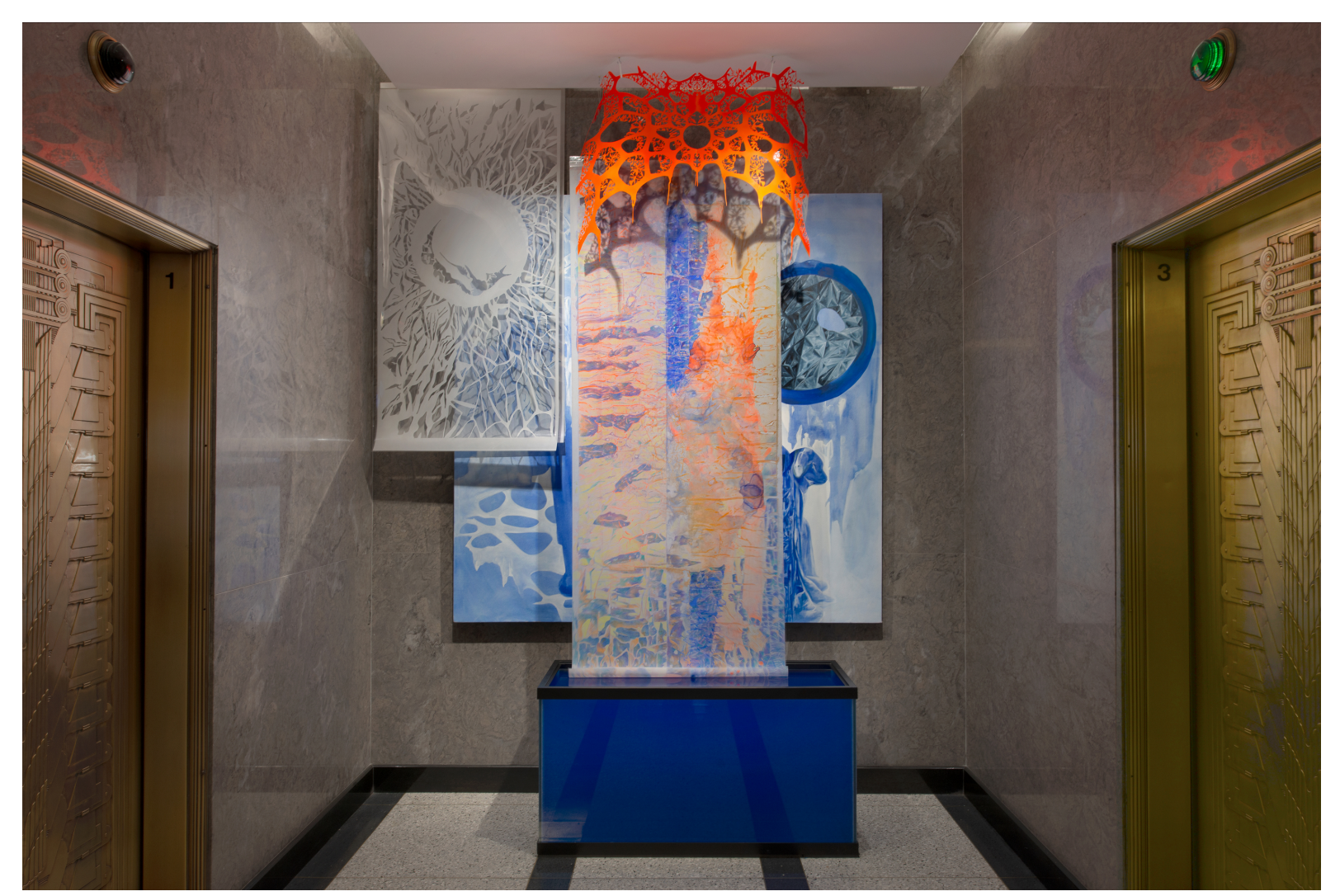
Keren Anavy, I Wish I Had a River, The Underground Lobby Garden, 2021, ink and colored pencil on Mylar, Oil on linen, Laser paper cutout, clear tank, water, ink, site-specific installation at ZAZ10TS Lobby Gallery Space.

The Underground Lobby Garden considers the history of the location in regard to nature, specifically waterways. Born and raised in the arid geo climates of Israel, water is a recurring theme in Anavy's work. A block away once stood Croton Reservoir, now the Public Library and Bryant Park. While the Bricken Textile Building (10 Times Square) is classic Art Deco with many of its original decorative ornamentation adding another layer of site-specificity to the installation imagery.